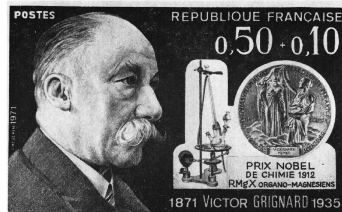
Stamp issued in 1971